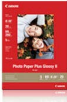
Photo Paper Plus Glossy II