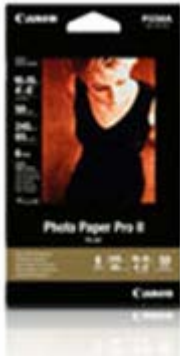
Photo Paper Pro II