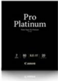
Photo Paper Pro Platinum